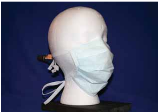
Figure 2 Surgical Face Mask