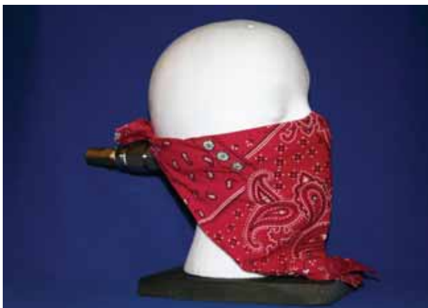
Figure 4 Bandana Face Mask