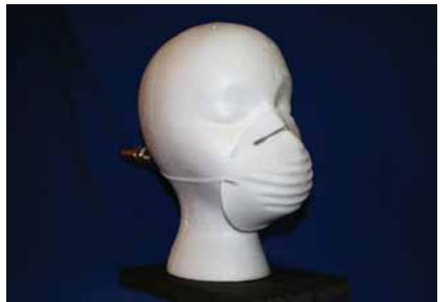
Figure 3 Pre-Shaped Face Mask